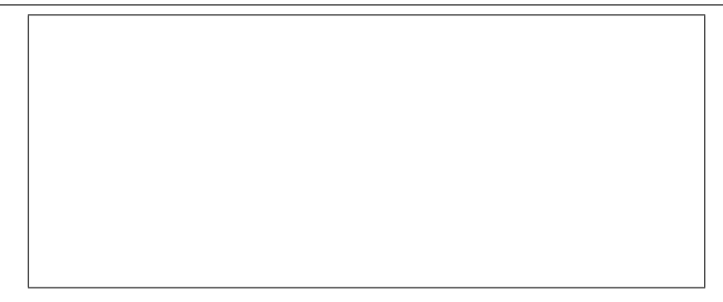
Figure 2: Example of a short caption, which should be centered.

As you can see, the above text follows standard scientific convention, reads better than the first version, and does not explicitly name you as the authors. A reviewer might think it likely that the new paper was written by Zeus et al. , but cannot make any decision based on that guess. He or she would have to be sure that no other authors could have been contracted to solve problem B.